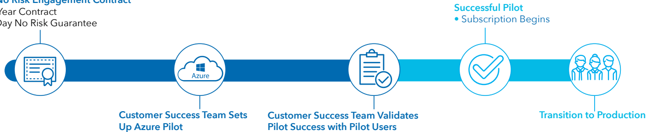
Figure 2: Industry-first, no risk Customer Success Program