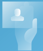
Organization Policies and Rules