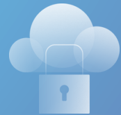
Security Best Practices

At its core, GitHub serves as the open-source hub — a dynamic platform where collaboration thrives. DexMach understands the intricacies of this collaborative ecosystem . It's not just about lines of code; it's about how content is consumed, standardized, and optimized . This approach opens the door to code spaces, a powerful feature that provides fully configured development environments in the cloud. While maintaining standardization, organizations can still install additional features, ensuring flexibility and productivity. DexMach's training empowers organizations to harness the full potential of GitHub , fostering efficient collaboration and informed decision-making.