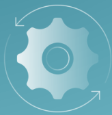
Tailored to your needs

Welcome to our hands-on workshop, designed specifically for administrators and developers aiming to enhance their GitHub environment. We offer customized workshops that can be conducted in your own setting, tailored to meet your unique needs. Our services include two distinct paths for GitHub Administration : setting up a fresh environment or refining an existing one using industry best practices. The outcome? A well-managed , optimally functioning GitHub environment with streamlined repository flow and robust security at the organizational level.