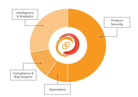
Calder7 is made up of more than 30 security experts