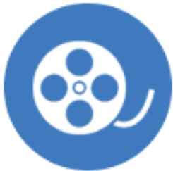
Media and Entertainment