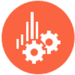
Manufacturing and Energy