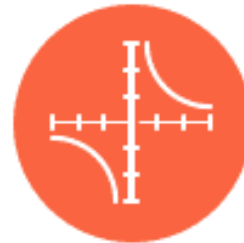
Engineering and Construction