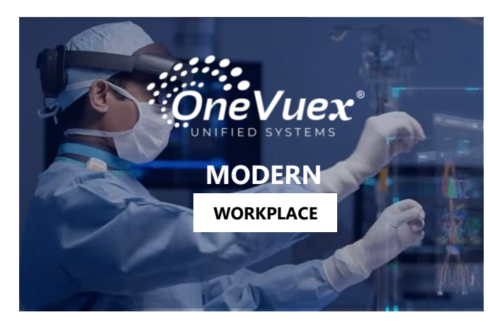
Achieve 40% greater productivity, confident decisions, and a workplace adaptable to change.

OneVuex Unified Systems is an AI powered digital knowledge network and productivity center that intelligently integrates data, content, insights, contacts, and tech innovations, displaying combined results in a single interface. With OneVuex, generate ideas and content faster, complete time-consuming tasks, and gain AI driven insights with advanced security incorporating Zero Trust strategies.