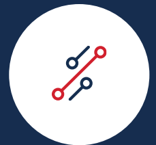
Engagement Conclusion and Next Steps