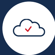
Cloud Application Discovery