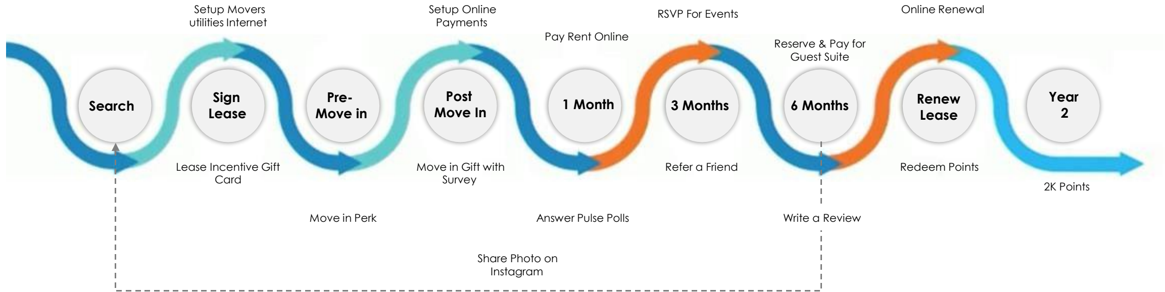
The Resident journey