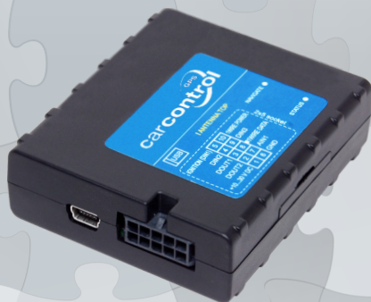
GPS-CarControl Compact/Perfect Box