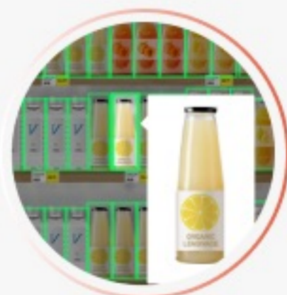
Image Recognition Software for Retail Audits