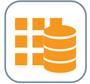
Application + Database