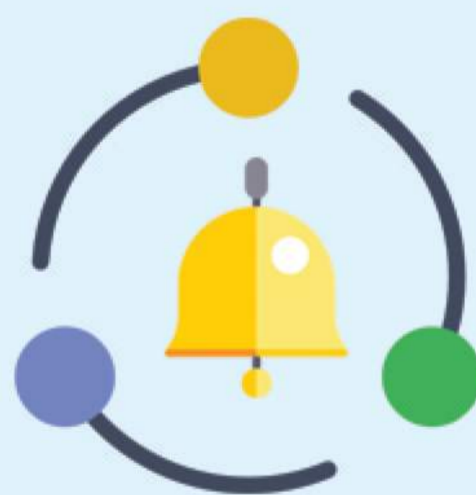
Alerts & Suggestions