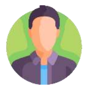
Digital Workplace Evangelist

Vast years of experience in architecting and designing solutions on M365 including VIVA connections.