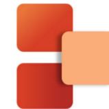
Project Service Automation