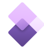
Finance and Operations