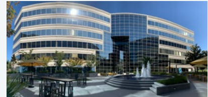
Headquarters Campbell, USA