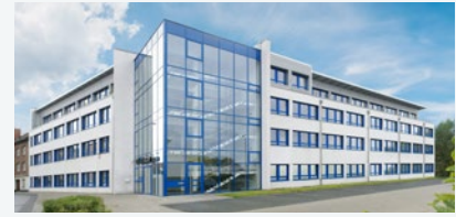
Headquarters Aachen, Germany