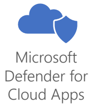
Microsoft Defender for Cloud Apps