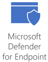
Microsoft Defender for Endpoint