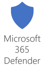
Microsoft 365 Defender