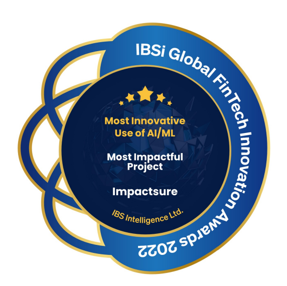
Most Innovative Use of Al ML- 2022

Global awards for - Innovation, Unique Differentiators & Scalability!