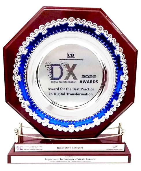
CII- DX Transformation Award 2022