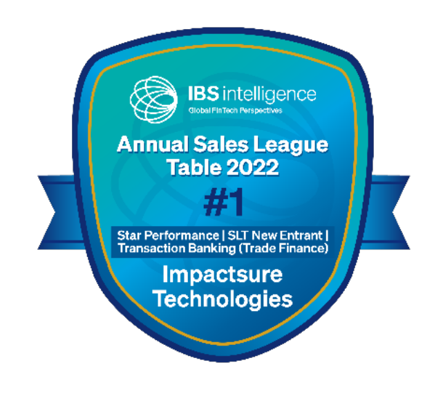
Annual Sales League Table- 2022