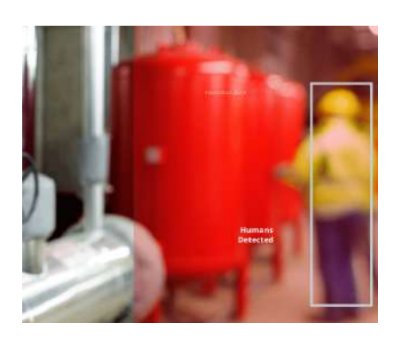
Hazardous/ Restricted Areas Monitoring

Automatically detect and alert construction-site workers and visitors without hard-hats and other PPE