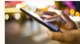
How do raise service request