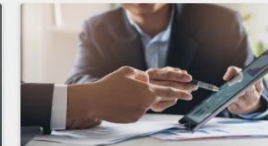
Complete BU Induction