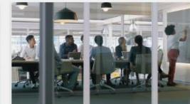
Finish your post onboarding activities