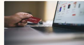
How do I raise Travel request