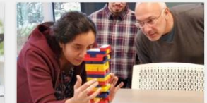
Set your goals