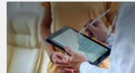
Complete Mandatory Trainings