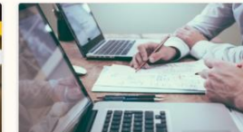
Where can I find HR policies and documents