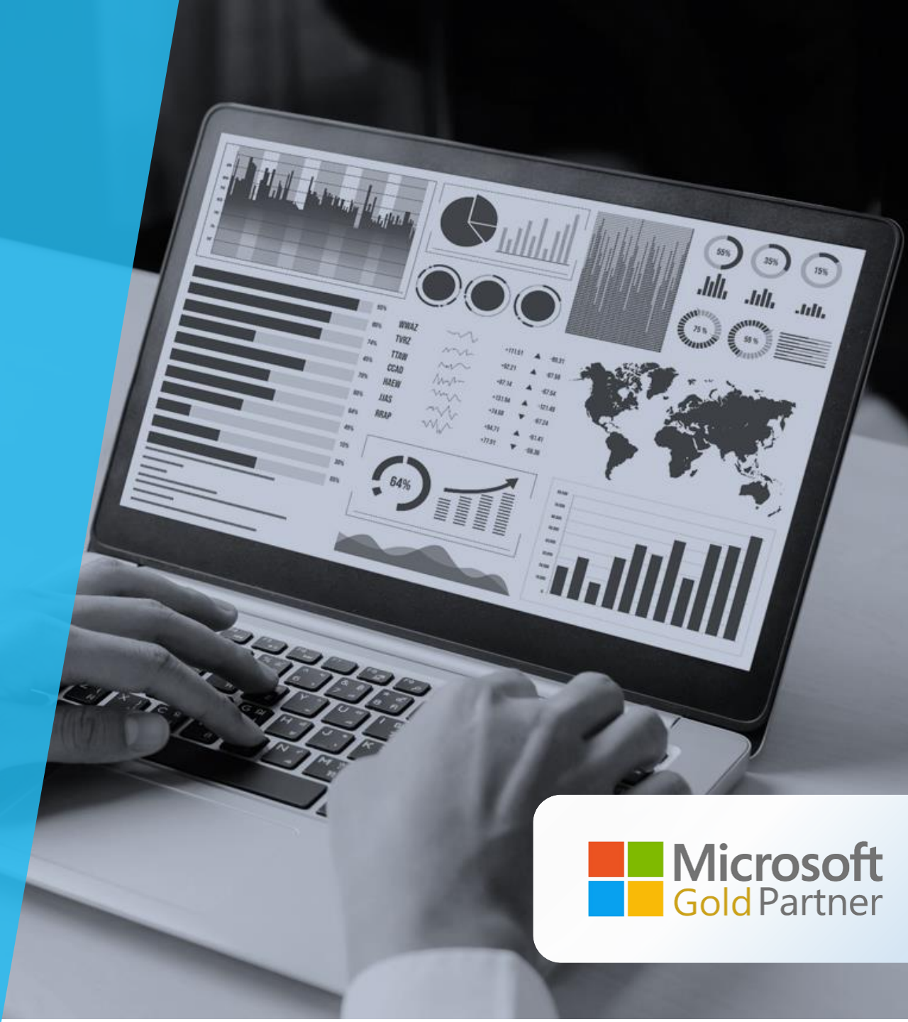
Tableau to Power BI Accelerator