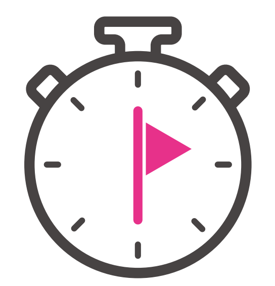
Prove More Cases in Less Time Structured & controlled investigation

Sharing is caring. Become more effective at fraud investigations by sharing authorized case information and knowledge with internal and external stakeholders. Stay on top of the game and don't get lost in data, e-mails or files.