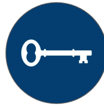
Certificate & Key Management