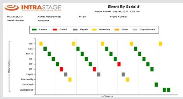
HLA Serial Number history report with link to LLAs

In addition to our pre-built reports and analytics, the BlackBelt system allows secure access via 3rd party tools like PowerBI, Excel, Minitab, MatLAB, and other industry-standard data