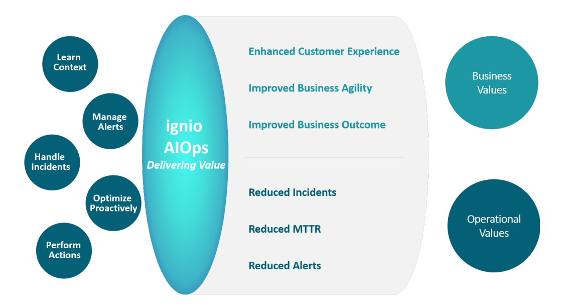
Fig. 2 - ignio™ AlOps : Translating Features to Customer Values