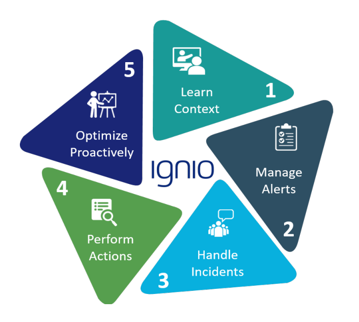
Fig. 1- Core capabilities of ignio™ AlOps

It detects and assesses the deviation in system behavior, triages and resolves the incidents, predicts the future state and prescribes actions proactively to prevent any disruptions of datacenter operations.