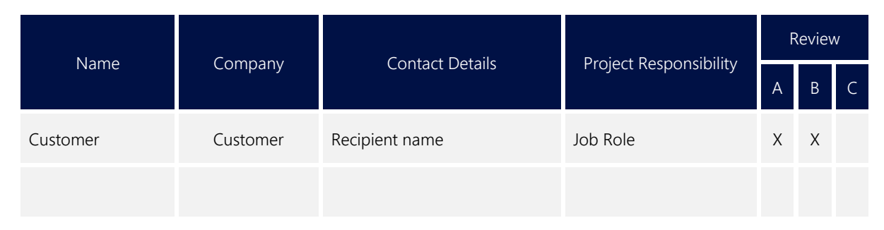
Key: A = Draft; B = General\ release\ issue ; C = For\ information\ purposes