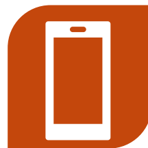
End user devices