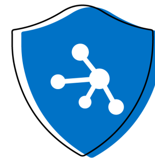
Defender for IOT