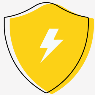
Defender for Endpoint