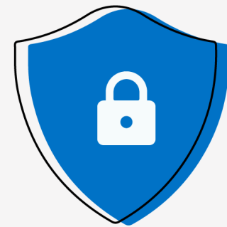
Defender for Cloud