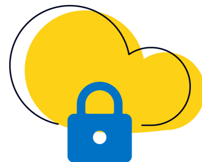
Defender for Identity