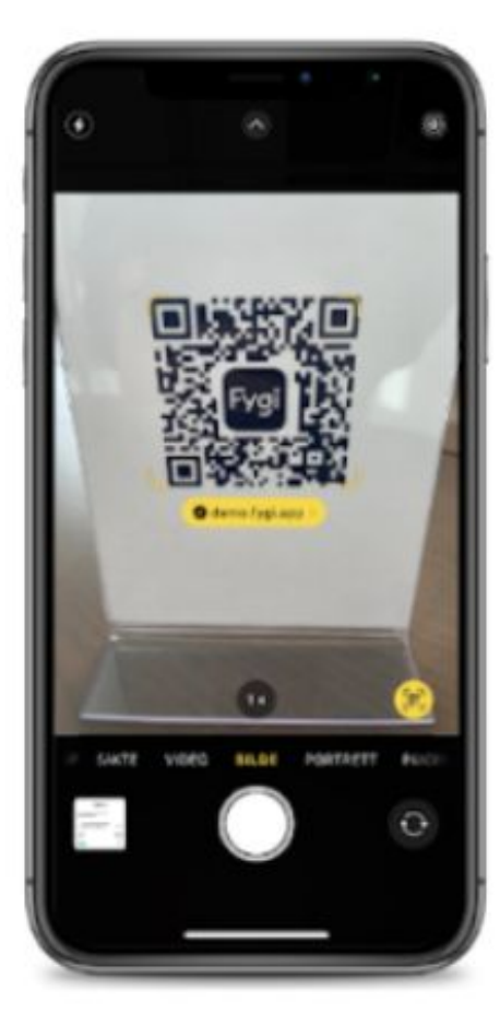
Client starts by scanning a store unique QR code