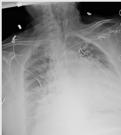
X-ray of patient with COVID-19

Physicians in the US are using X-rays to triage patients with COVID-19 symptoms. Despite showing symptoms some are sent home, only to return within 24 hours requiring immediate intubation and emergency care, suffering from lung capacities as low as 30%. Rapid X-ray tests are missing something crucial.