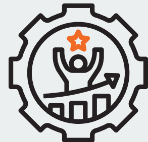
Optimize sales performance