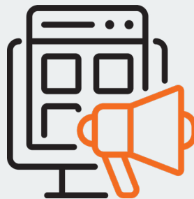
Build relationships remotely