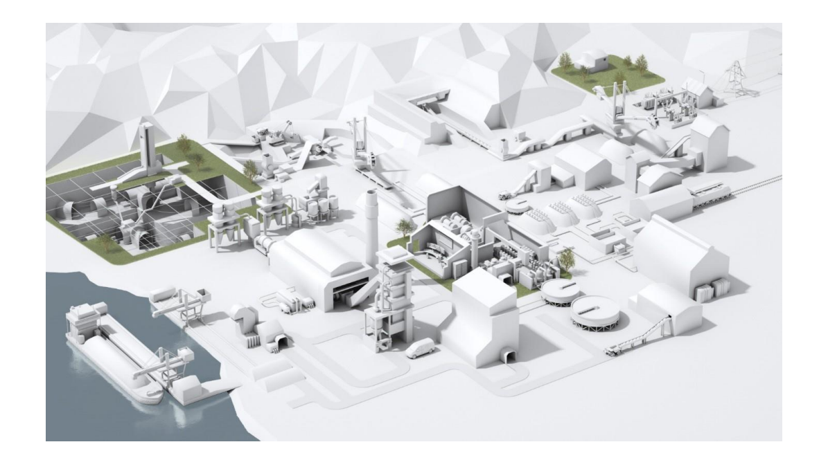
ABB Ability™ Collaborative Operations for mining