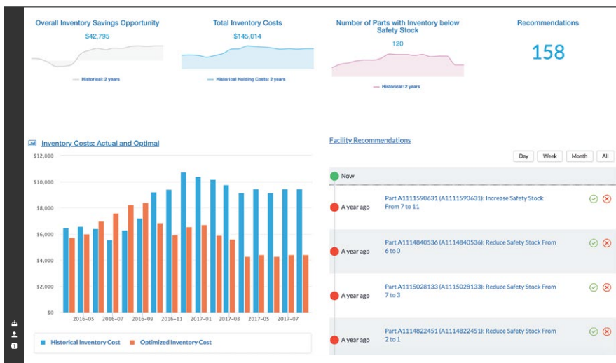
Figure 1: Home screen of BHC3 Inventory Optimization. Operators are able to view potential inventory savings and inventory costs, identify parts with highest savings opportunity, and view recommendations to optimize part inventory levels.