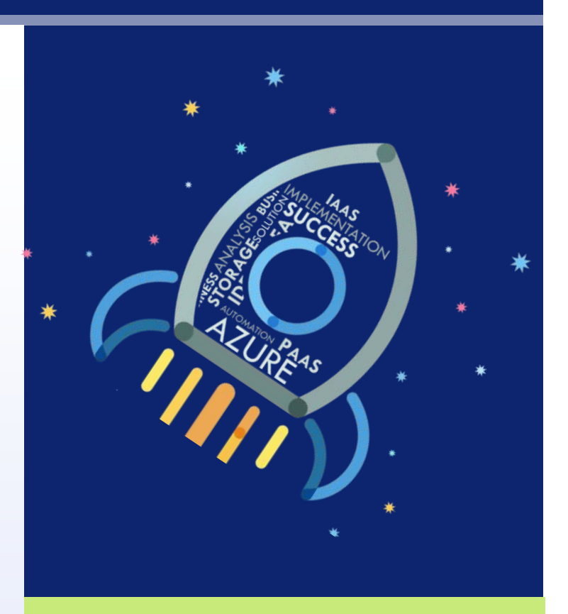
"Working with InCycle has been unbelievable and extremely valuable to us and our survival." Jim Ellerbeck CTO