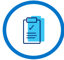
Azure VMware Solution Migration Assessment