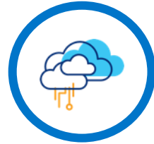
Azure VMware Solution Migration