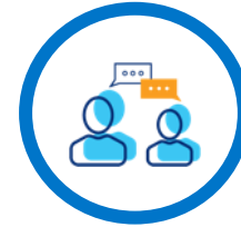
Managed Services Anywhere for Azure VMware Solution

And with Lumen Managed Services Anywhere for AVS and Azure, you can: