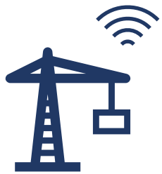
Machine Monitoring & Control Devices