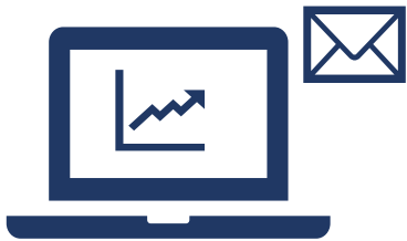
Analytics and notification