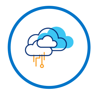
Application modernisation and enhancement