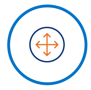
Identify additional workloads to be moved to native Azure