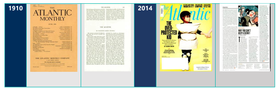
In the 1800s, The Atlantic primarily used a 2-column layout. By the 1900s, the magazine switched to a consistent 3-column layout that in turn is further split by more artifacts, images, and symbols.

Advertisements did not appear within The Atlantic until the 1900s. Full-page ads of the early 1900s and embedded article-page ads beginning in the mid-1900s introduced complex layout changes that required different models.