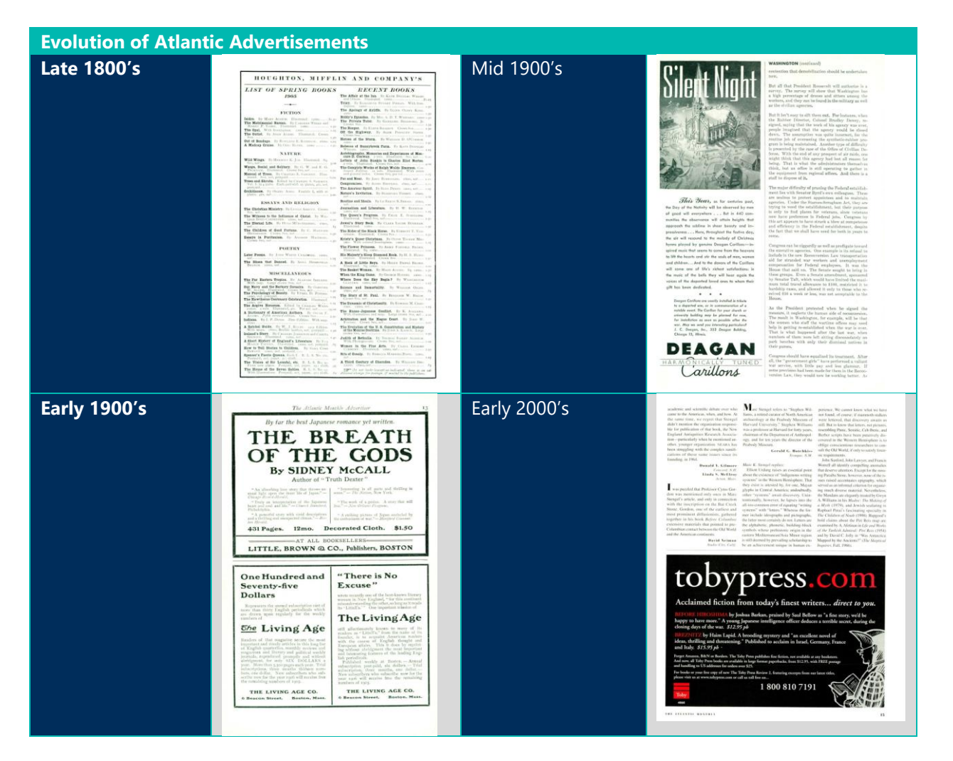
Phase Two: The Atlantic Labeling Strategy

Advertisements did not appear within The Atlantic until the 1900s. Full-page ads of the early 1900s and embedded article-page ads beginning in the mid-1900s introduced complex layout changes that required different models.