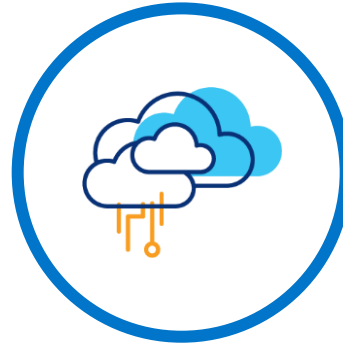
Azure VMware Solution Migration