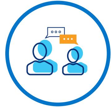
Azure VMware Solution Managed Services