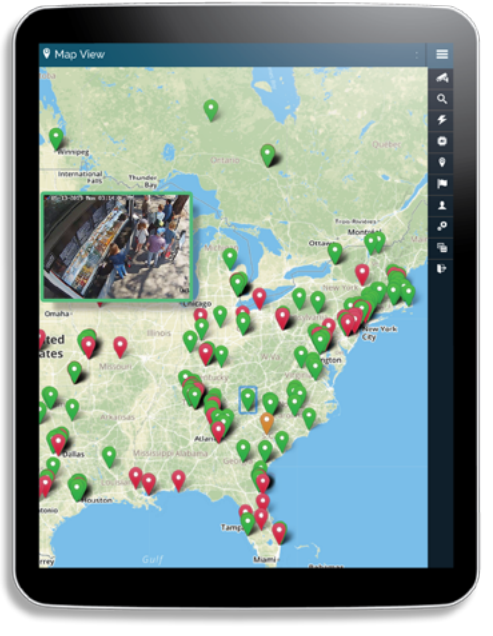
Centralized surveillance management for your entire organization