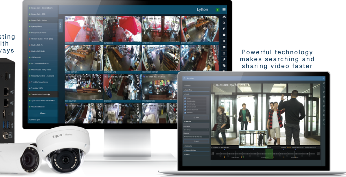
Connect Cloud Cameras directly to the cloud in seconds

Connect existing cameras with Cloud Gateways