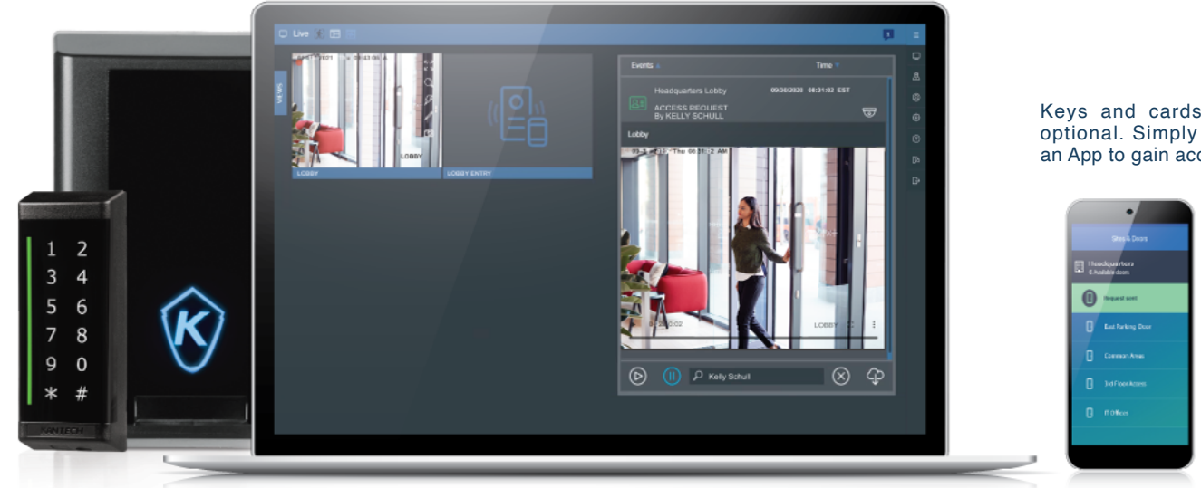
With video surveillance and access control managed together, Cloudvue keeps a linked-record of the credentials used to unlock a door along with the surveillance footage of when it happened.

Kevs and cards are optional. Simply use an App to gain access.