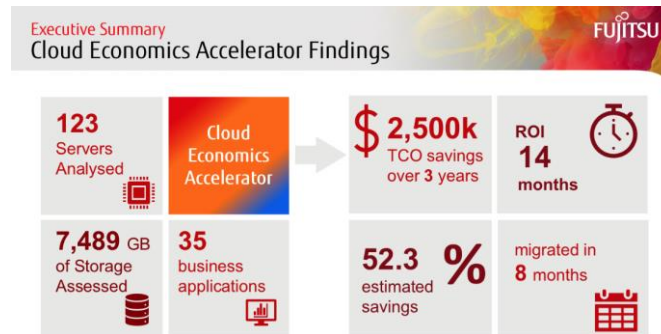
Assumption based What-If Scenarios

A solid business case is built from accurate data on your current and future infrastructure needs. The Fujitsu Cloud Economics Accelerator includes an optional automated data discovery tool to scan your existing infrastructure and construct an accurate view of servers, compute and storage requirements.