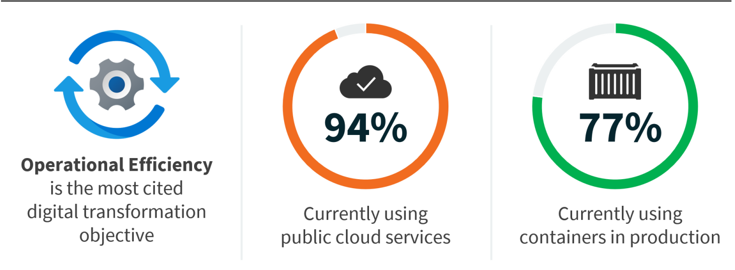
Figure 1. Efficiency, Public Cloud Services, and Containers

Leveraging containers orchestrated by Kubernetes is a continuation of that theme, enabling engineers to speed development and add features to applications more quickly. In ESG research, 77% of respondents are currently using containers in production applications, with another 21% planning to in the next year.<sup>3</sup>