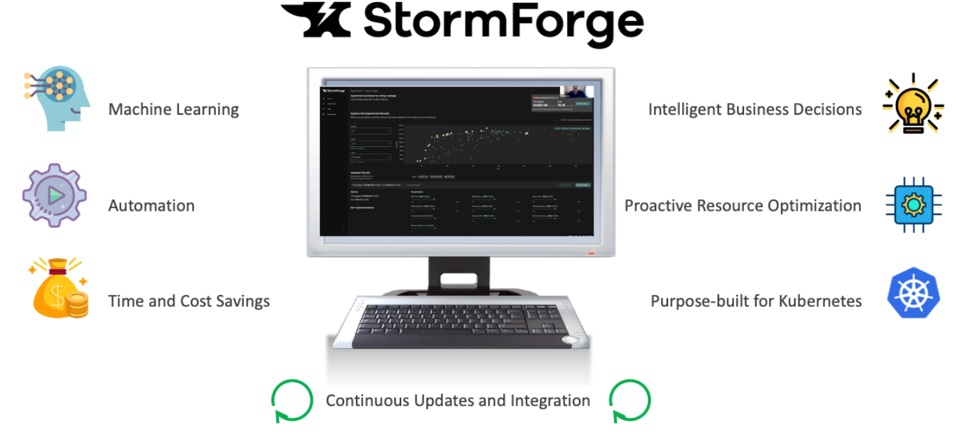
Figure 1. StormForge

StormForge can eliminate time-consuming, manual testing and tuning, helping organizations make better Kubernetes resource decisions, achieve their business objectives, reduce costs, and keep developers focused on innovation instead of manual tuning.