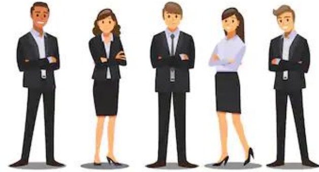
3 - Sales Teams