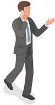
2 - Sales Representatives