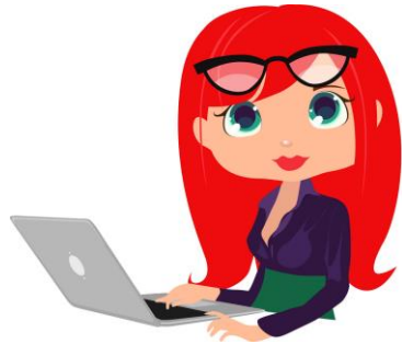
1 - Sales Manager

Quick Maps can be useful for a variety of users..