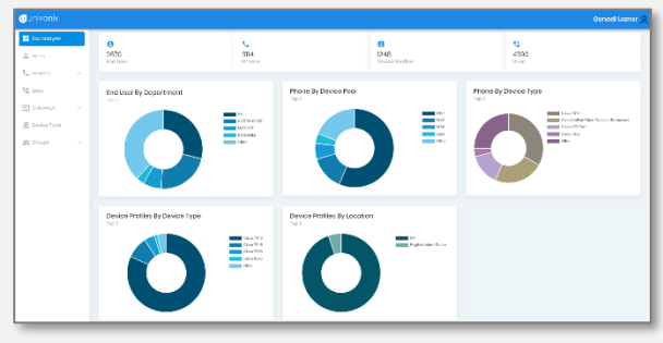
Detailed PBX Analysis Dashboard