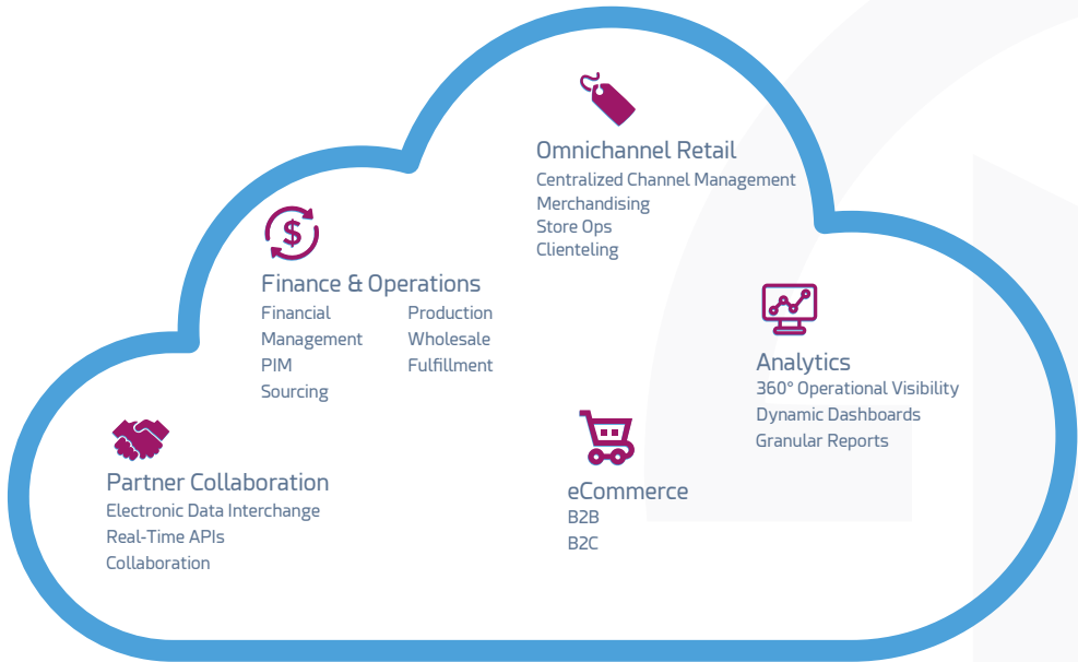
An end-to-end, cloud-enabled enterprise platform with embedded AI and analytics

HauteLogic is an innovative unified platform that enables fashion organizations to stay a step ahead of the competition by reimagining business processes, and embracing disruptive ideas and technology. With a strong focus on customer experience, HauteLogic provides a comprehensive suite of state-of-the-art-modular components for fashion supply chain, direct-to-consumer operations, omnichannel fulfillment, distribution, and manufacturing.