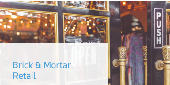
Brick & Mortar Retail

Manage your end-to-end fashion wholesale supply chain with built-in partner collaboration, customer engagement, planning, and operational decision making driven by automation and machine learning