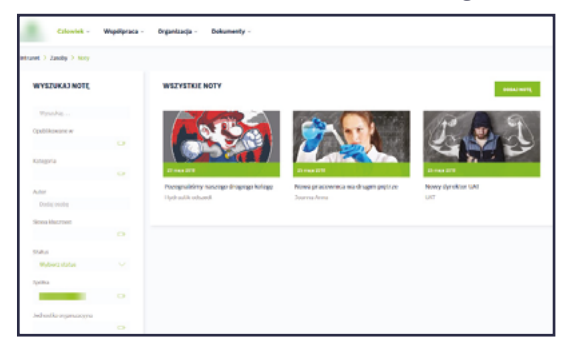
Personnel notes – a place for HR to welcome new employees or for announcements of personnel changes

Organization chart allowing for targeting content to the relevant divisions or regions