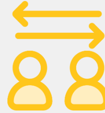
Missing Bidirectional communication