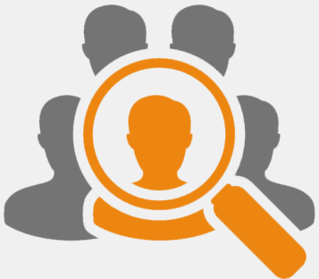
Finding The Right Person