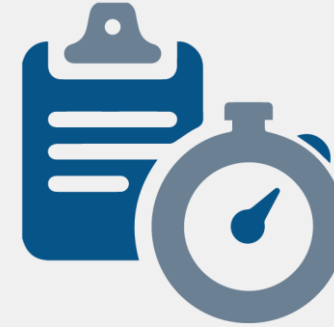
Lack of access by Mobile Workforce