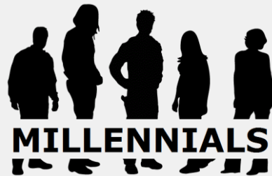
Digital Migrants to Digital Natives