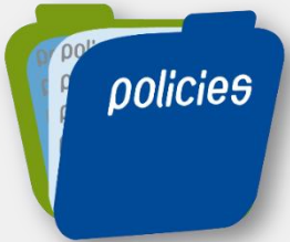
Access to Work practices, SOPs