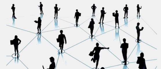
Real time alerts and notifications