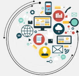
Missing Corp Comm.