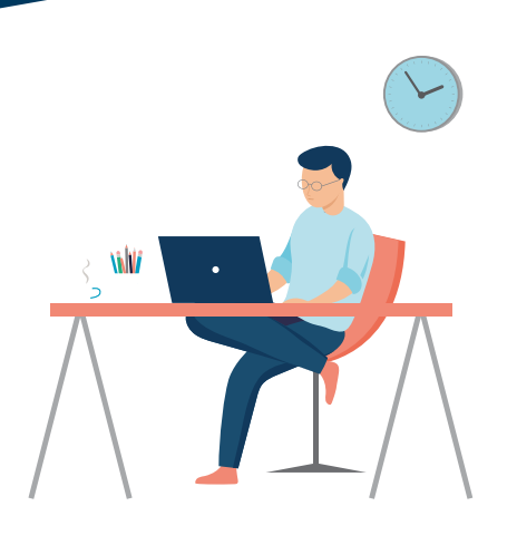
*Carve out of Carve in

Get started with an HSO Carve out* assessment. During this assessment you will gain a clear understanding of the current infrastructure, network and hardware. Other aspects covered by the assessment are the digital workplace and the security architecture. The scope and activities are summarized in a set of recommendations, so that you can make an informed decision about how you can support the new organization with the right cloud strategy and migration.