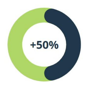
Increased customer engagement