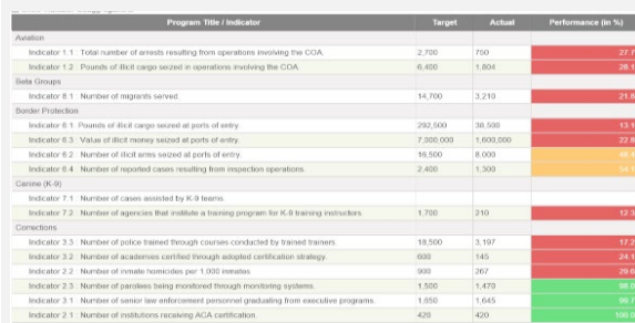
Predefined and on-demand reports can be easily generated, saved, shared, and exported