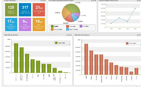
Versatile dashboards enable real-time analysis of an organization's portfolio and performance

Interactive results frameworks at the project and organizational levels showing performance data