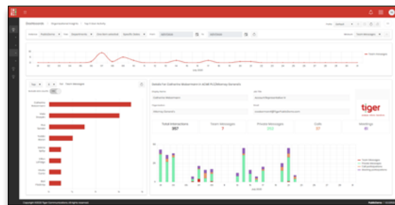
Organizational Insights - Top X User Activity